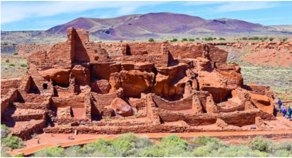
The ruins of Wupatki will be a featured destination of Carpool Caravans for May 31. The day-trip will also lunch at the historic Cameron Trading Post, as well as visit the Sunset Crater.