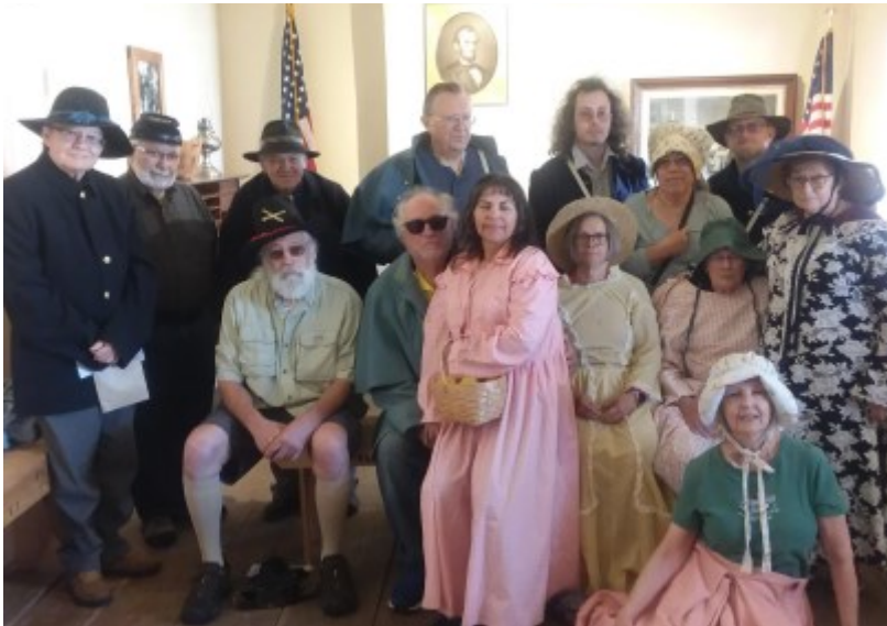
In April, several of the Carpool Caravans visited the Fort Verde Museum (in Verde Valley) adorned in period clothing.